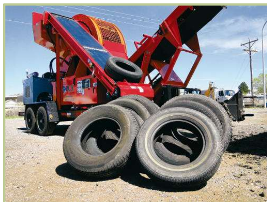
Scrap Tire Management