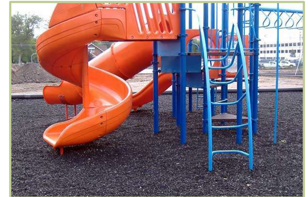
Stimulating Recycling Markets