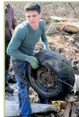
Illegal Dump Cleanup and Prevention