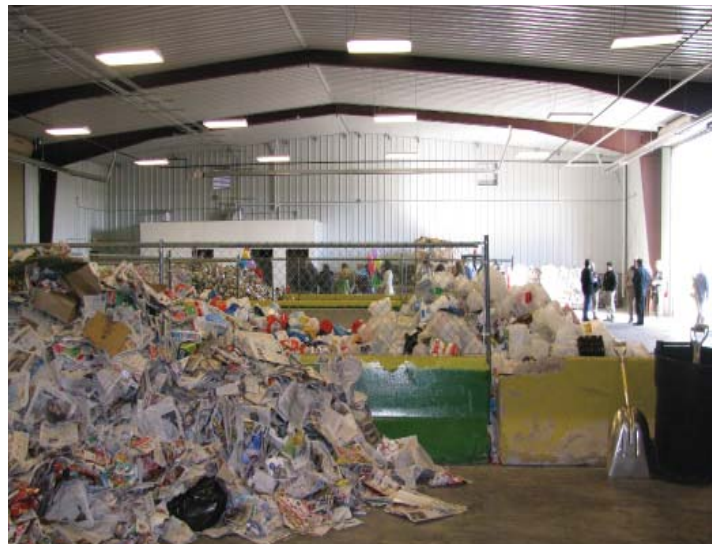
Roswell's New Recycling Processing Facility

Throughout this report, we have identified granting agencies, foundations and sponsors according to the appropriate programs they supported. NMRC would like to express special appreciation to the Crawford Family Foundation for their general support as it has allowed us to grow as an organization over the past several years!