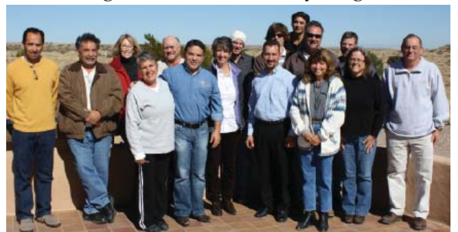
NMRC Board of Directors at 2010 Board Retreat

The NMRC Board is elected by the membership for a two-year term with the option of running for three consecutive terms before terming out. Officers are elected annually by the board. Board meetings are held six times a year. The board hosts 4 committees: Executive, Policy & Legislation, Conference & Trainings and Rural Recycling Advisory.