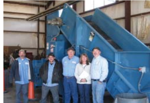
Angel Fire Recycling Center

Technical assistance in regard to recycling planning, development and outreach is available to all eligible communities. Please do not hesitate to contact us for assistance!