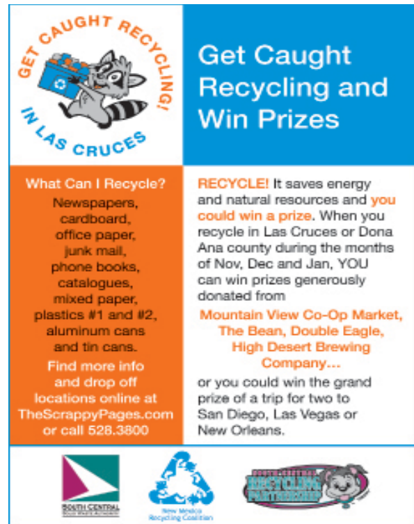
Get Caught Recycling Print Advertisement

During this three month, incentives-based campaign SCSWA staff randomly surprised and rewarded City of Las Cruces and Dona Ana County residents weekly as they dropped off recyclables at any of the City's 17 drop-off sites or any of the county's 8 community collection centers. Winners received prizes donated from area businesses that range from coffee mugs to the grand prize of a vacation for two to one of ten destinations. The Las Cruces campaign featured print advertisements twice per week in the Las Cruces Sun News, ads once per week in the weekly Las Cruces Bulletin, and radio PSAs on Magic 105 FM and KOBE AM throughout November, December and January.