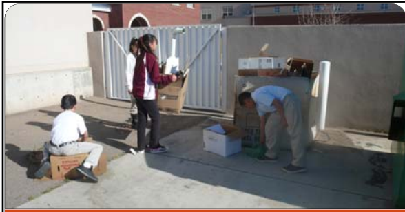
Cardboard is ready to be picked up for recycling.