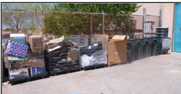
UNMVC bins after unloading school recyclables

Repeat the Waste Audit. Did students reduce the amount of trash?