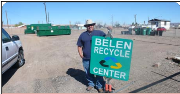
Partnership with City of Belen