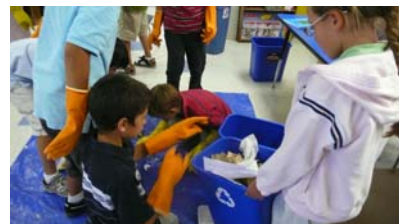
One Belen class reduced the number of pieces of trash by 48%.

Repeat the Waste Audit. Did students reduce the amount of trash?