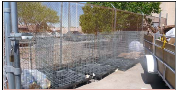
Partnership with UNMVC